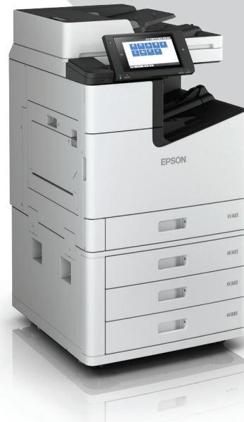
Print small or fine text very clearly

5,350 sheet max paper input with optional paper feed